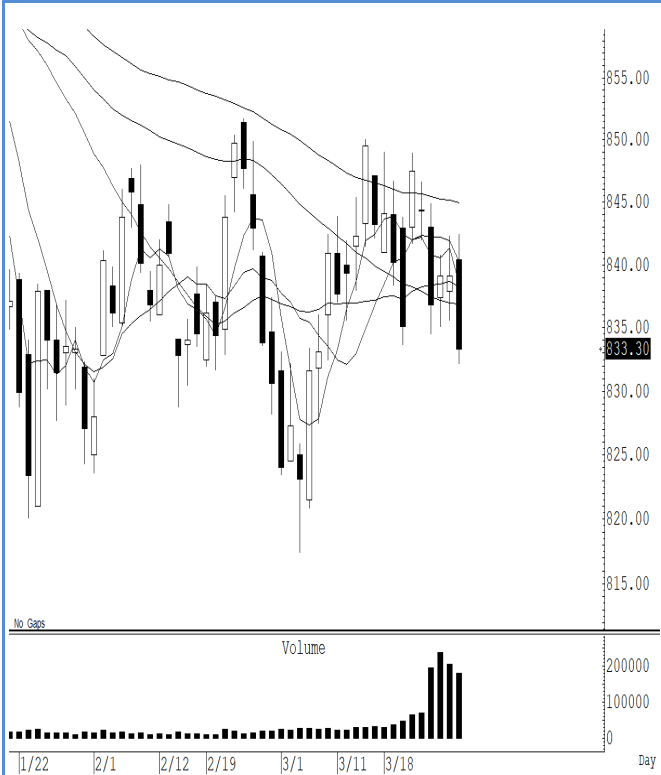
S50M24 (Close 833.30 Chg -5.80)